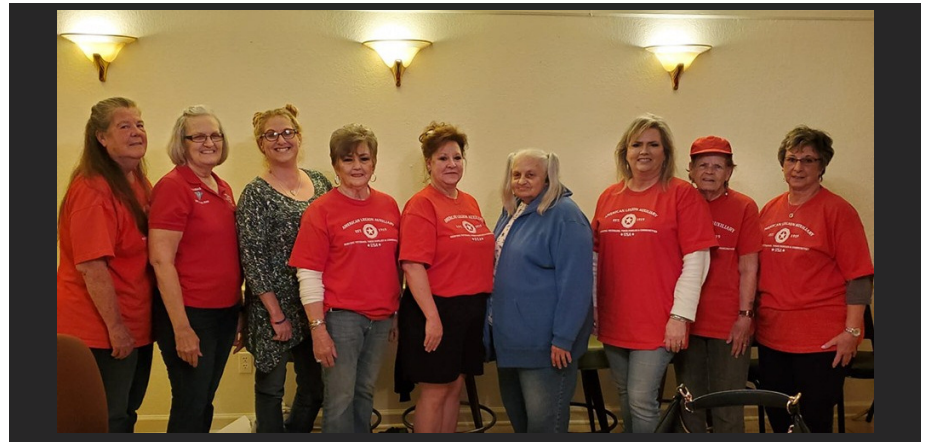
Officers for 2019 - 2020.