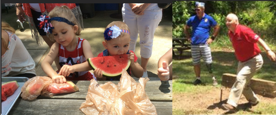
Two youngest entrants in the watermelon eating contest.

POST 64 HONOR GUARD IS SEEKING NEW MEMBERS. WE CURRENTLY HAVE THREE MEN OUT WITH INJURIES OR RECENT SURGERIES. IF YOU ARE INTERESTED, PLEASE CONTACT BONNIE TATOM OR COMMANDER KEN WAHLGREN.